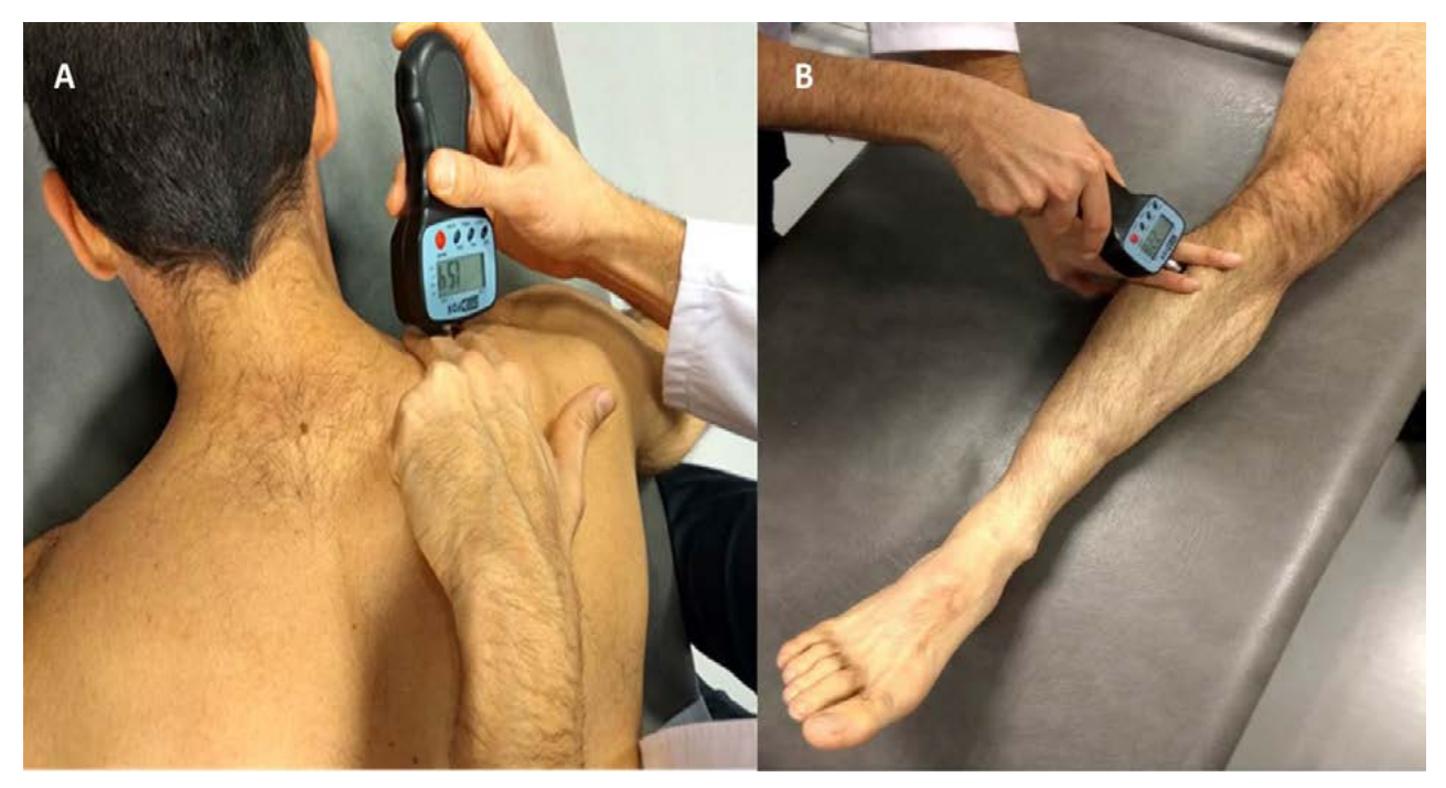
FIGURE 2. PPT assessment over the right upper trapezius muscle (A: midway between C7 and acromion) and the right tibialis anterior muscle (B: upper one-third of the muscle belly). Abbreviations: PPT, pressure pain threshold.